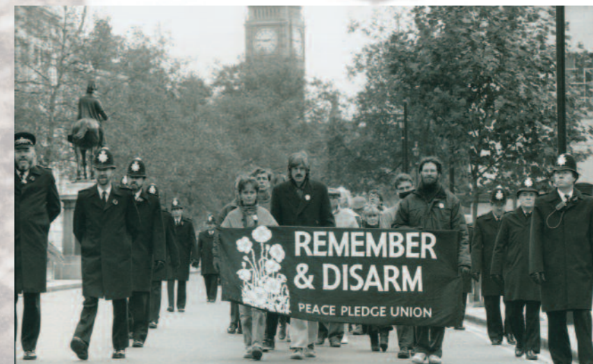
Walking past the statue of General Haig, who commanded the British army in WW1 to lay a wreath of white poppies at the Cenotaph on Remembrance Day.

While the coffin of every British dead soldier is televised, photographed, saluted on its way from the airport to the coroner and soldiers are named in Parliament by the Prime Minister as heroes who performed a valuable task, the 30,000 or so Afghans killed as a result of this war remain nameless, as do the 2.5 million refugees who are relegated to the status of victims for whom British charities raise funds from the British taxpayer.