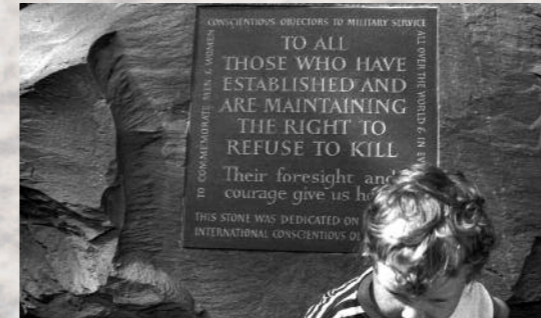
Memorial stone to commemorate conscientious objectors. London.

While politicians give the order to go to war it is the soldier who ultimately pulls the trigger. To simply blame politicians while praising soldiers for doing a good job ignores the long chain of responsibility. This includes, for example, the workers at the BAE's factory in Crewe whose 4 million plus bullets have been fired in Afghanistan. Refusing to do a bad thing is always right. All around the world and down the centuries men and women have refused to take part in war.